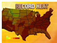
Heat Wave Sweeps Nation