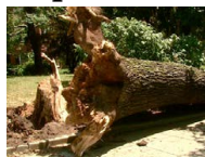
Raw Video: Storms Rip Through East Coast