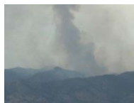
Raw Video: Evacuees Nervous As Fires Progress