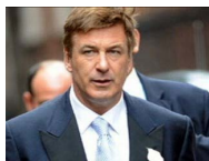
Alec Baldwin Ties the Knot